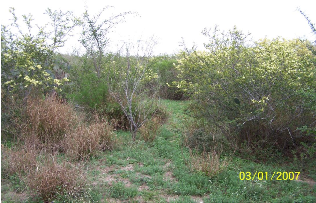
Brush Management Before

BRUSH MANAGEMENT EFFICENCY BY ROOTPLOWING TO RESTORE DESIRED VEGETATIVE COVER TO PROTECT SOILS, CONTROL EROSION, REDUCE SEDIMENT, IMPROVE WATER QUALITY AND ENHANCE STREAM FLOW.