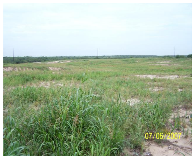
Critical Area Planting After