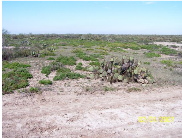
Range Planting Before