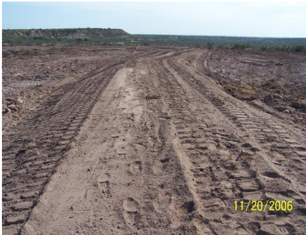
Critical Area Planting and Terrace Before