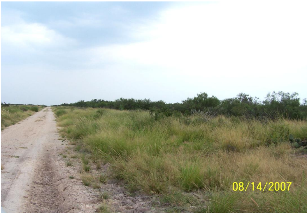
Brush Management After