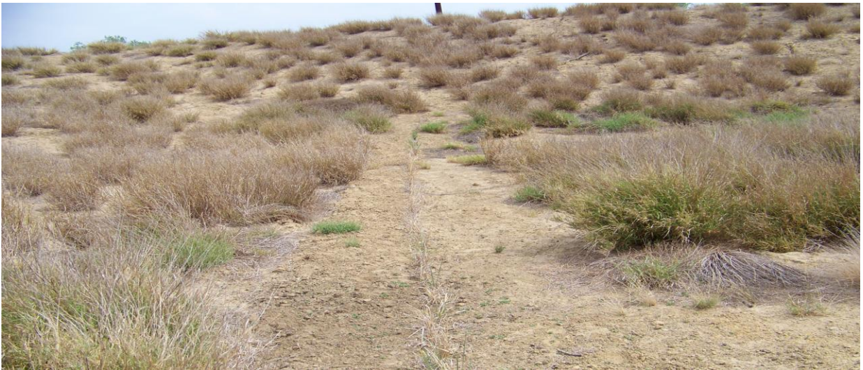
Vegetative barriers Big Sacaton