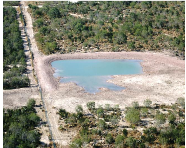
Pond Site After