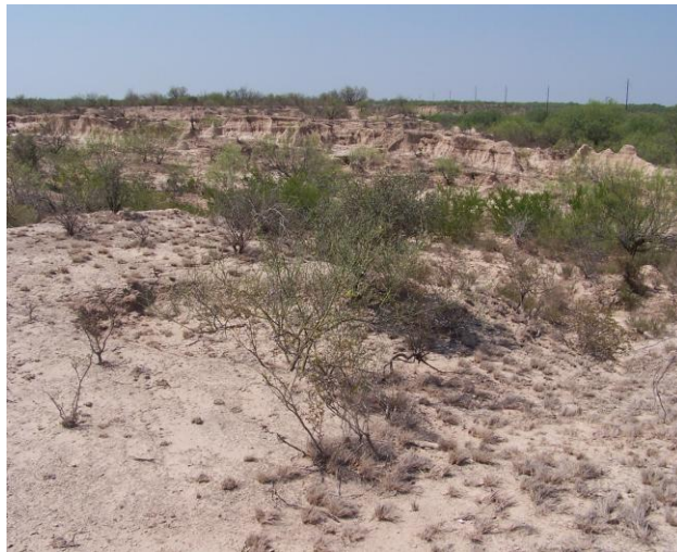
Critical Area Planting Before