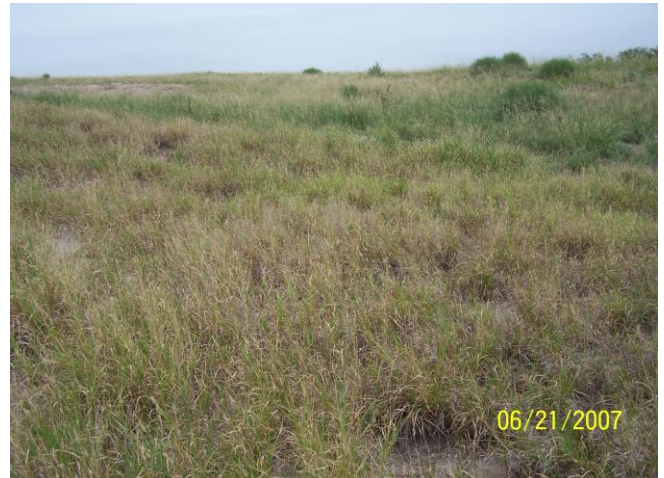
Critical Area Planting and Terrace After