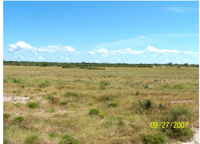
Range Planting After