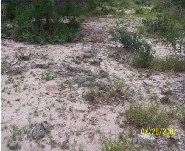
Pond Site Before

POND TO IMPOUND WATER BY CONSTRUCTING AN EMBANKMENT OR BY EXCAVATING A PIT TO MAINTAIN OR IMPROVE WATER QUALITY. TERRACES/DIVERSIONS USED TO REDUCE THE OCCURRENCE OF ACTING AND CLASSIC GULLIES ON AREAS DOWN SLOPE OF THE TERRACE/DIVERSION AND TO REDUCE RUNOFF VELOCITY SO SEDIMENTATION OCCUR IN THE CHANNEL.